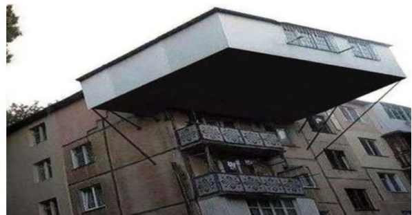
Fig. 3. Appearances of added external structures carried out by resident