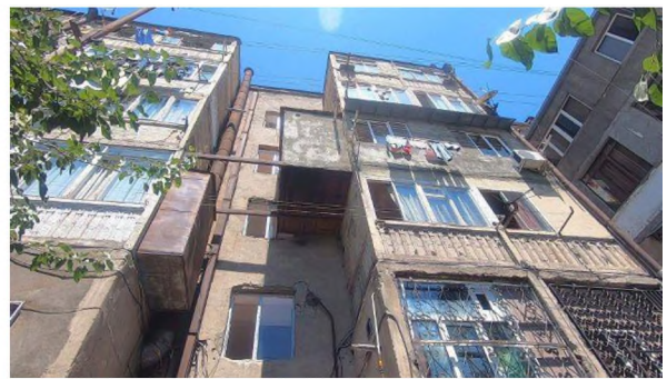
Fig. 2. Added balcony on full height of building