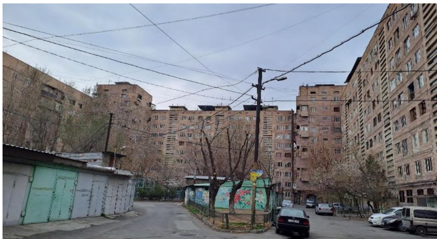
Fig. 5. "Combining" six buildings into one general spatial building