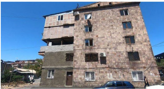
Fig. 1. Added outbuilding

As a result of the progressive development of industrial construction in the Republic of Armenia in the 1970s-1990s, the city of Yerevan was built up with multi-story residential buildings built with prefab RC frame, frame-panel, large-panel, raised floor method and other constructive solutions [2]. New residential districts appeared (Nor Nork, Erebuni, South-Western, Avan, Davitashen), where the majority of Yerevan's population lives today.